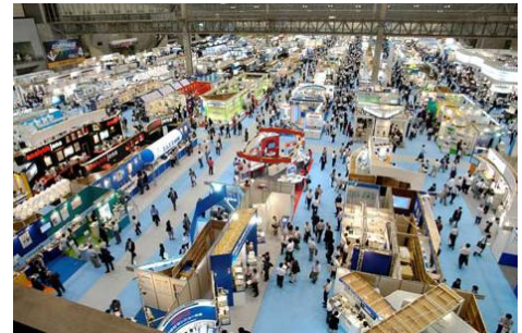
Packaged Booth Stand with Basic Equipment